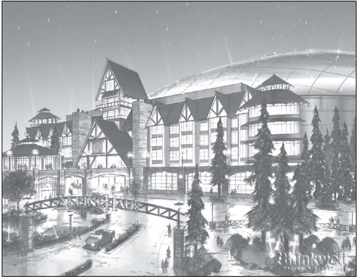
An artist's rendering of the Las Vegas Snow Dome indoor ski/snowboard facility.

The waterpark itself will consume roughly 30 acres, with 250,000 square feet of that