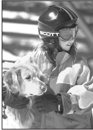
Alpine Meadows Photo

The Lake Tahoe Snow Report podcast can be accessed online at www.laketahoesnowreport.com .